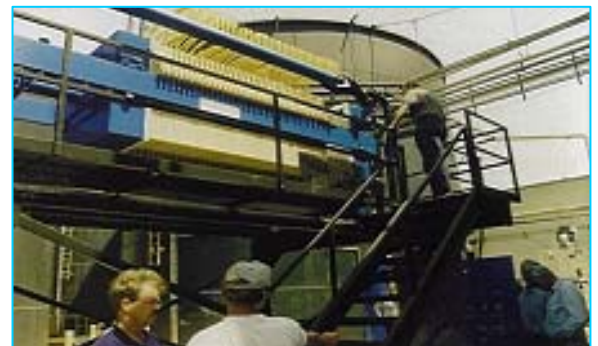
Plant managers inspect the unit June 2000